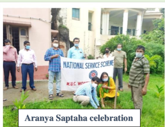
Aranya Saptaha celebration