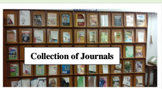
Collection of Journals